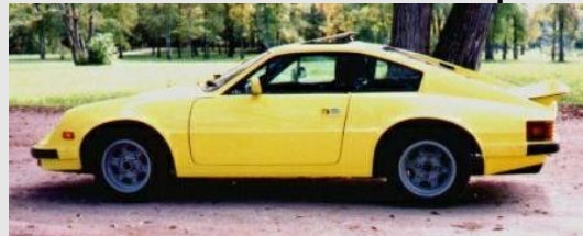
This picture was taken September 1998.