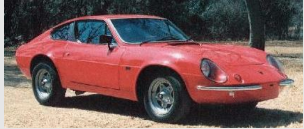
This is a second run car from 1989-1991.