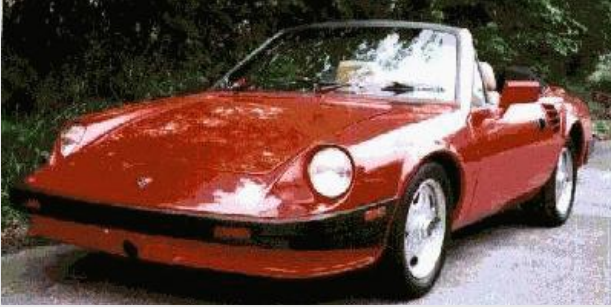
Late model with water cooled VW engine in the rear.