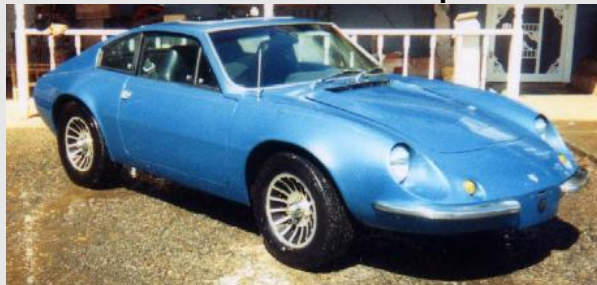
Blue is a relatively uncommon color. Owner: Ron Sample